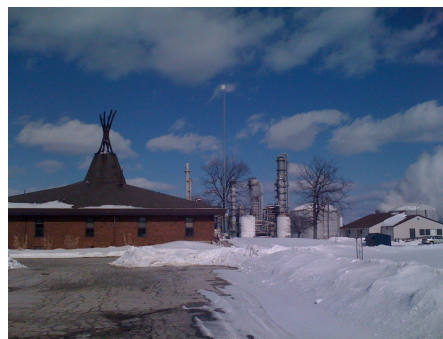
This image shows what used to be the daycare for the Aamjiwnaang community and how close to a petrochemical plant it is